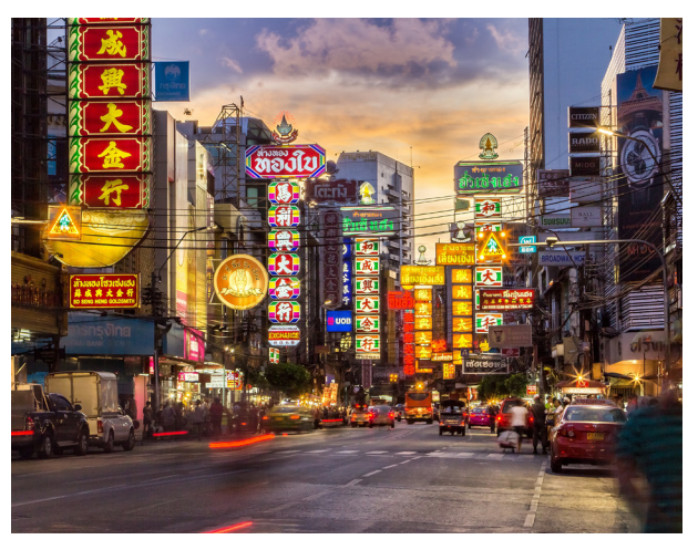
Figure 6 a) | Yaowarat road, Bangkok | Thailand

Figure 7 shows an example of how the same urban environment can play host to different human activities or be associated with