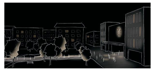
Figure 7 c) | Early morning