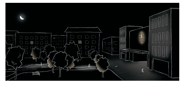
Figure 7 b) | Night