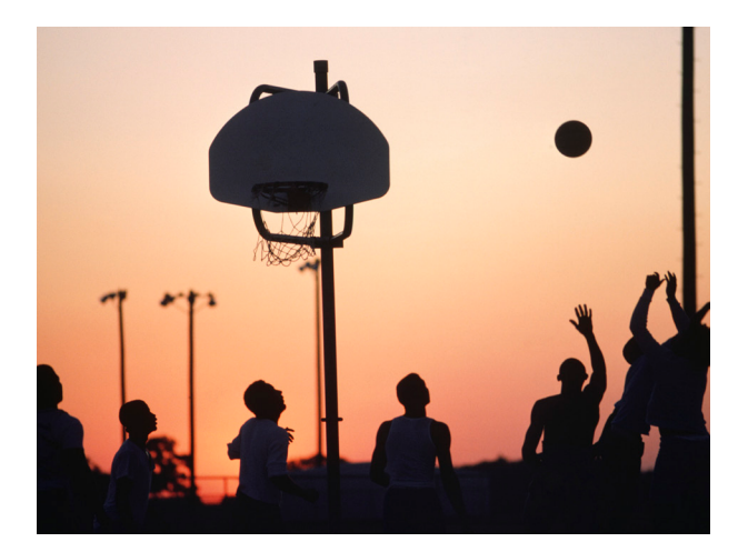
Figure 3 | People playing basketball during dusk hours

Plans for urban spaces and urban lighting should not be exclusively focused on human beings. Indeed, the overriding natural ecosystem (that revolves around human beings and yet is quite clearly composed of many other factors, such as animals, plants and climate) should always play a prominent role. Nevertheless, we will now focus on how people perceive the external environment. This will help us to accurately understand the issue of light at night, depending on the psychological perceptions that characterise certain types of urban environment. As Daniel Berlyne argued, people are constantly looking for knowledge