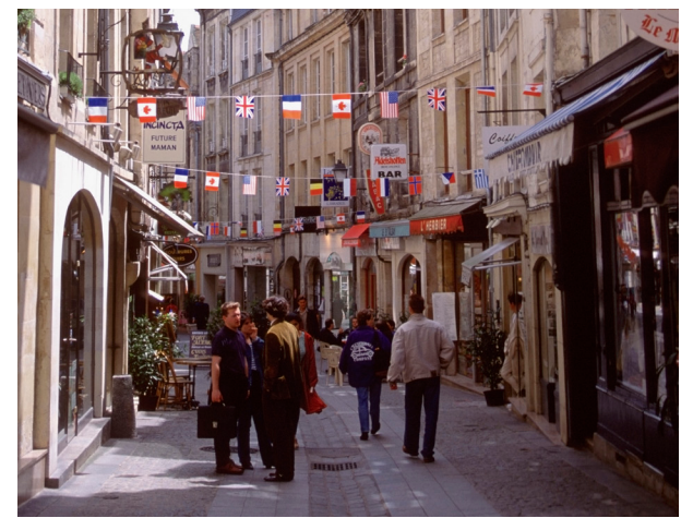
Figure 6 b) | Caen, Normandy | France