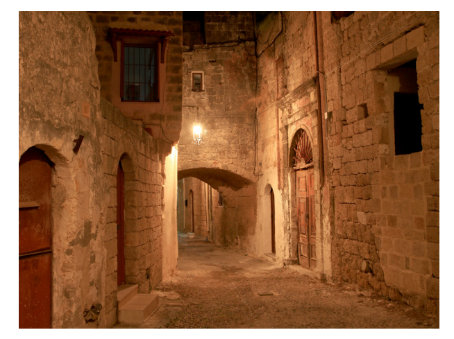
Figure 1 | Rhodes old town

We naturally have to start with the context in which we find ourselves. Currently more than half the world's population live in urban areas. By 2050 this percentage is expected to rise to around 75%. The growing demand for living spaces within cities, their renovation and their planning – together with the emergence of various new activities related to the movement of people, innovative transport systems and advanced communications infrastructure – mean that the modern city is truly a 24-hour place. In this way, the five elements of the urban structure defined by Kevin Lynch in "The image of the city" (paths, edges, districts, nodes and landmarks) assume increasing importance within society, especially at night. This also means that the "imageability"<sup>2</sup> and "way-finding"<sup>3</sup> characteristics of an urban space assume even greater value when darkness falls.