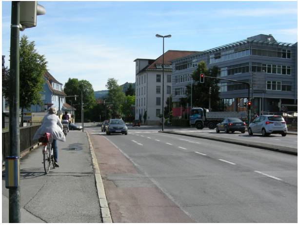
Figure 5 | Sägerbrücke in Dornbirn, Austria – In 2016 the old space has turned into a place with social identity thanks to a renovated architecture and a human scale lighting.

The information that people derive from the surrounding space depends on the planned scale of the environment and the range of related activities. For example, the context of the space shown in Figure 6 a) is designed primarily for people travelling by car. This means that the information needs to be understood quickly and from a distance whilst travelling at speed and with restricted visual focus. The context was therefore developed around the necessary activity, which in this case is the movement of people by car. The scale of use of this application is linked to the speed of 60 kilometres per hour that a car usually travels in this type of situation. In Figure 6 b) the space has been designed to a more human scale, in view of the fact that the people are only moving at 5 kilometres per hour. At this speed and with a wide