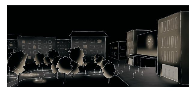
Figure 7 a) | Early evening

The variation in colour temperature within a defined time span affects the amount of melatonin produced by the human body, which in turn impacts directly on our biological status. The dynamism, intensity and colour of light can combine to stimulate a vast array of emotions. Certain design approaches also involve a psychological aspect.