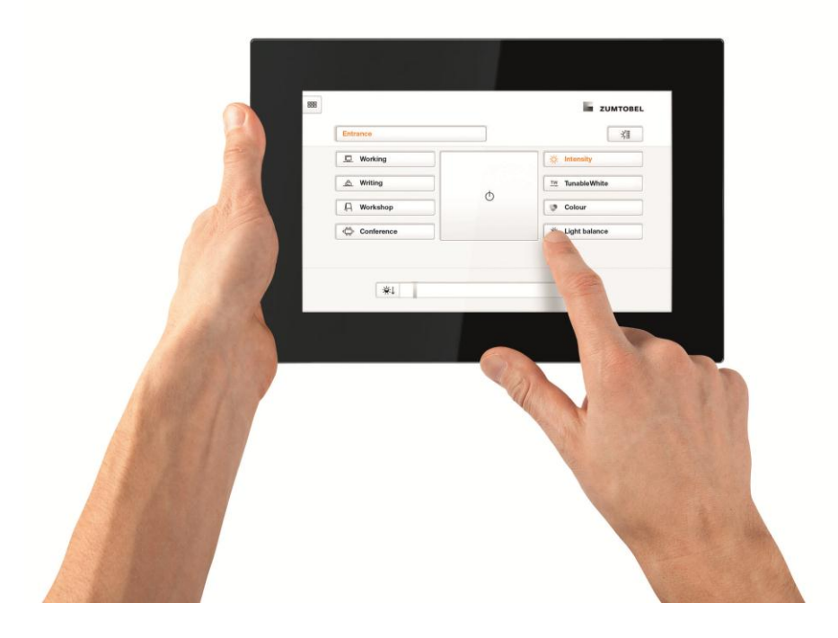
Photo 1: An independent time study from REFA Consulting has proved that the commissioning of a lighting management system with LITECOM is significantly faster than with a comparable KNX system.