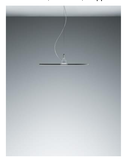
Image 2: The pendant luminaire features the side-lit technology: Here the LED light in the light sources is uncoupled in the transparent light guide panel and distributed evenly from the centre to the edge.