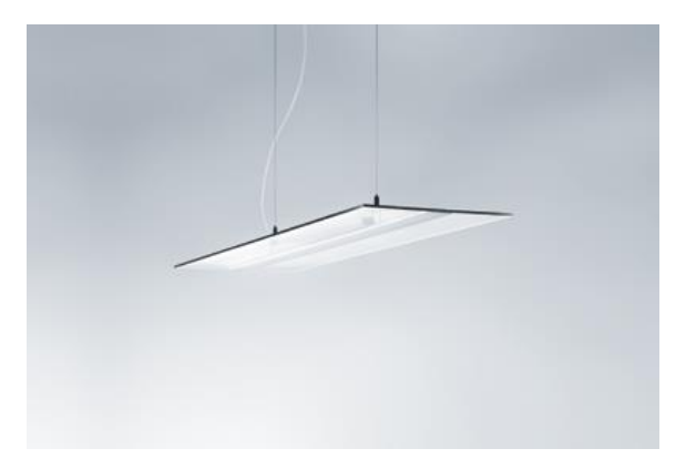
Image 1: On being switched on, VAERO looks like a super-slim, almost hovering light disk. When switched off, however, it appears no less elegant.