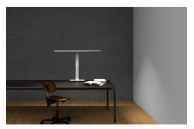
Fig. 1: TIGNUM - Grazer designers Benjamin and Markus Pernthaler developed an ergonomic lighting solution for the desk.