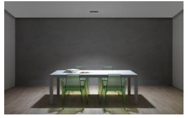
Fig. 2: DIAMO - The compact downlight is the perfect solution for a wide range of indoor applications.