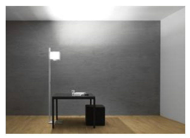
Fig. 4: ICE CUBE - A freestanding luminaire that can simultaneously illuminate two workstations.