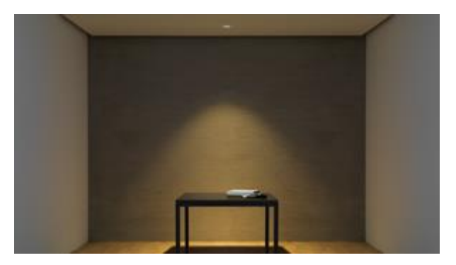
Fig. 3: CAMO - With its variety of designs and different versions, this downlight is suitable for a wide range of applications and operational areas.

Fig. 2: DIAMO - The compact downlight is the perfect solution for a wide range of indoor applications.