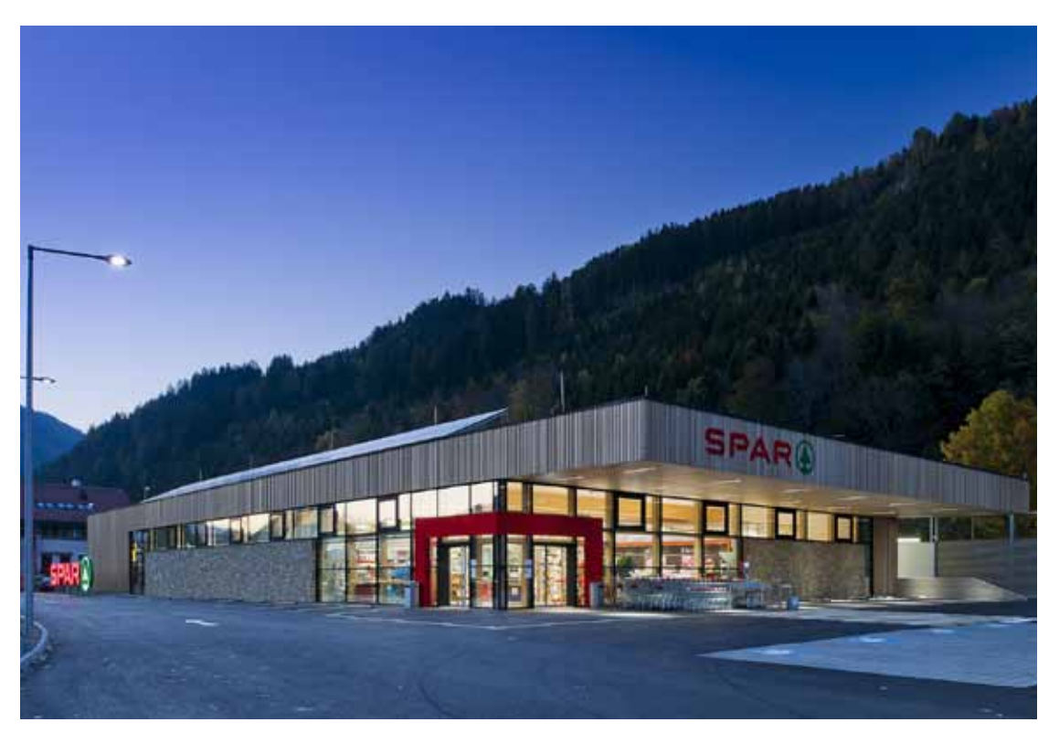
B3 I Hedera LED luminaires provide appealing illumination of the Murau-based supermarket even after sunset.