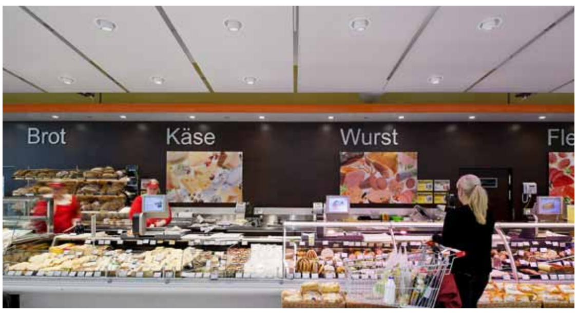
B1 I LEDs only: the first SPAR climate-protection supermarket was opened in Vienna, fitted with nothing but LED luminaires by Zumtobel. At the fresh-product counters, SL 1000 semi-recessed LED downlights provide high-quality, gentle illumination of the goods displayed.

With its new shop concept, SPAR has set an example: almost at the same time, SPAR's first climate-protection supermarkets were opened in Austria, in Murau and on Vienna's Engerthstrasse, as well as in Wetzikon, Switzerland, featuring a lighting solution by Zumtobel that is completely based on LEDs. For these supermarkets, Zumtobel had developed a uniform lighting concept based on LED luminaires only: general lighting in the three supermarkets is ensured by the Tecton LED continuous-row lighting system, which was presented for the first time at Light+Building 2010. The LED version of this tried-and-tested product by Zumtobel offers high lighting quality combined with efficient light sources that are nearly maintenance-free. Even the shelves, the side rooms and the outdoor areas are illuminated by LED products only. In combination with other innovative structural measures, the branches will save 50% of energy and up to 80 t of CO<sub>2</sub>.