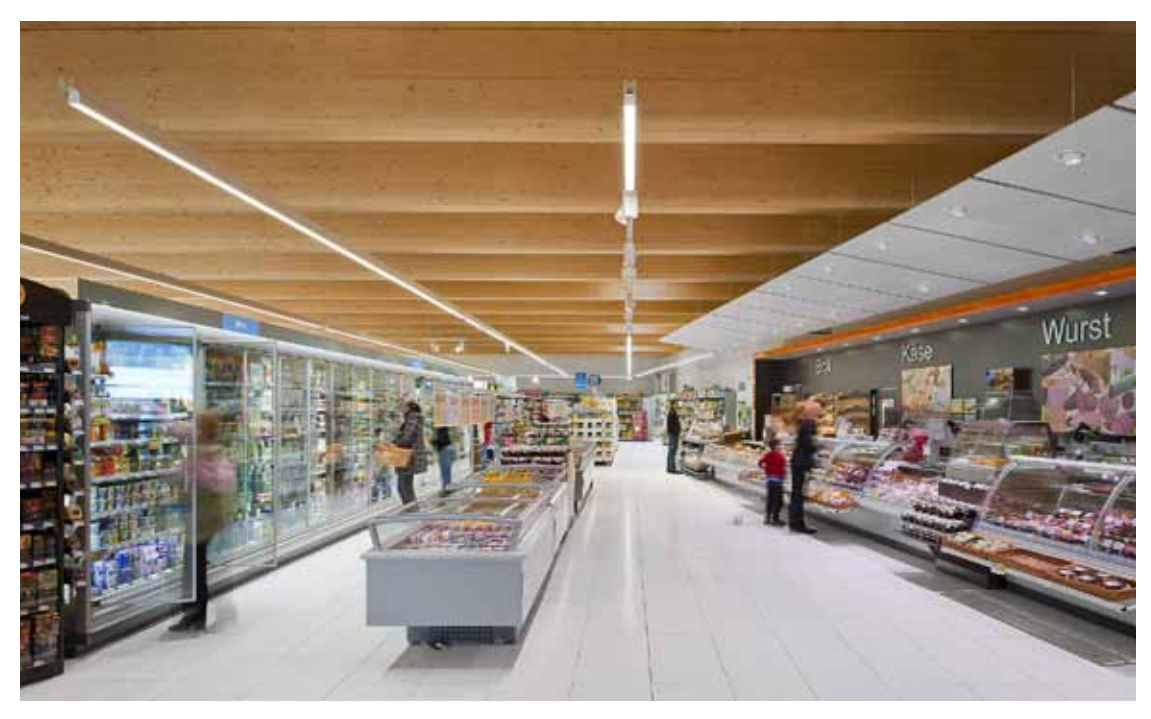
B4 I Thanks to innovative LED lighting, passive building construction, advanced building management and more, the supermarket branches located in Vienna and Murau save 50% of energy and up to 80 t of CO<sub>2</sub>.