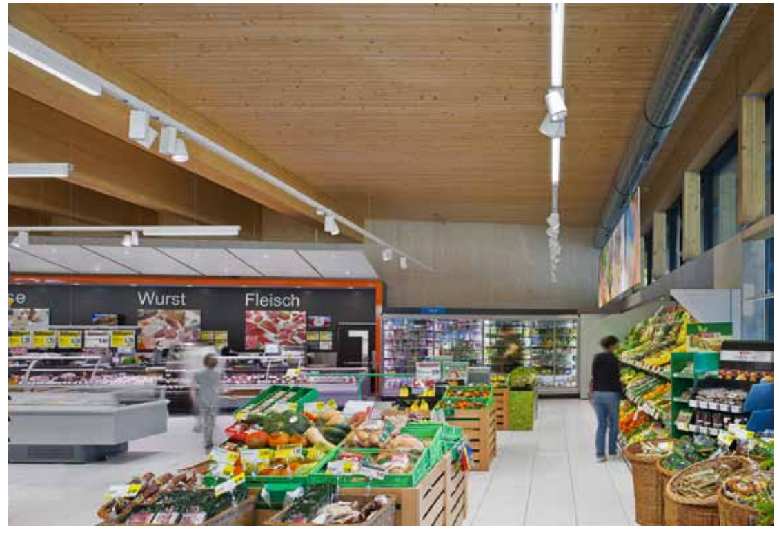
B2 I The Tecton LED continuous-row lighting system and the SL 1000 LED spotlight ensure a high level of lighting quality and attractive presentation of goods as well as low energy consumption.