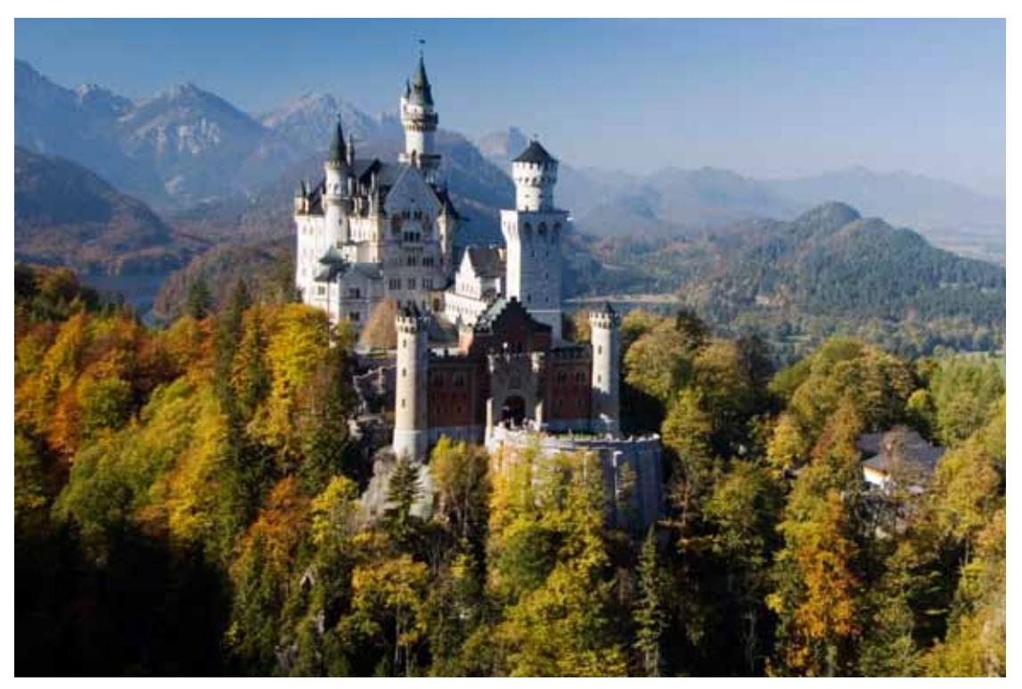
B1 I New LED lighting system by Zumtobel for the world-famous Neuschwanstein Palace near Füssen, Germany.

King Ludwig II would have been delighted! The sovereign, who had always been very open-minded about innovative technologies, had a number of sensational engineering advancements implemented during construction of Neuschwanstein Castle in the nineteenth century. All of these, but in particular the high-quality artistic furnishings of the magnificent rooms, are now being highlighted efficiently, but above all gently, by LEDs supplied by Zumtobel. Hence, the Supersystem LED lighting system and Tempura LED spotlights have recently been installed in the magnificent Throne Room. Nearly all areas that are accessible for visitors are scheduled to be fitted with individual LED lighting solutions by Zumtobel in the course of this year. Thus, the Bavarian Administration of State-owned Palaces, Gardens and Lakes has obviously skipped a few generations of lighting technology, proceeding directly to the most innovative light source, the LED.