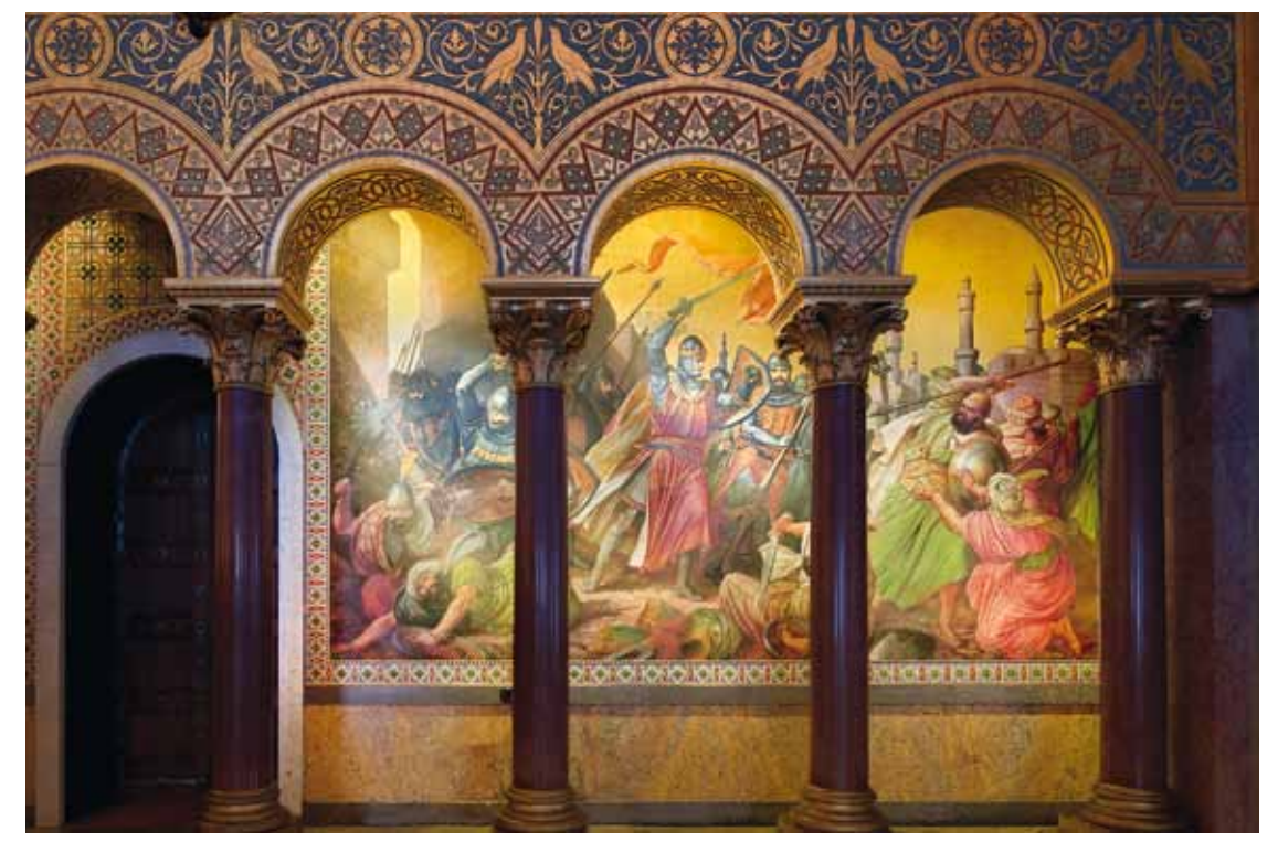
B3 I It is especially important to gently illuminate the art objects on display to preserve them for the next generations. LED light is free of UV and thermal radiation, thus protecting the valuable exhibits.