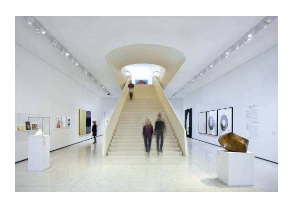
Caption 2: The new exhibition spaces are accessed via a sculptural staircase leading from the main entrance. Cutting-edge LED spotlights welcome visitors and direct their attention straight to the precious exhibits.

According to copyright law, the publication of indoor photos is only admissible with the consent of the competent collecting society for visual arts.