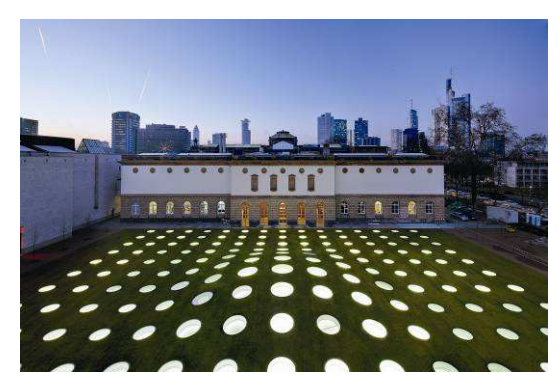
Caption 1: One hundred and ninety five circular skylights allow daylight to flood into the garden halls and transformthe garden into a gleaming carpet of light at night.