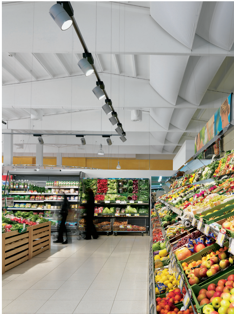
B2 | The Vivo spotlight range provides higher quality for accent lighting in shops and supermarkets.

In order to ensure a consistent lighting solution throughout the supermarket, the product range includes another Vivo LED spotlight. Featuring the same design as Vivo Tunable Food, Vivo LED Stable White provides high-power accent lighting for products displayed on shelves. Integral lighting solutions in a consistent design can now be implemented perfectly.