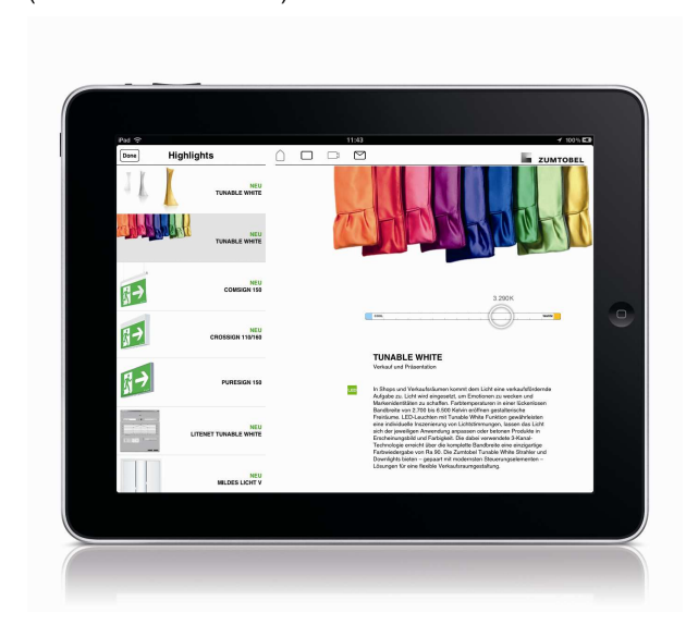
Caption 1: With immediate effect, a new, upgraded version of the Zumtobel "Map of Light" is available in the App Store.